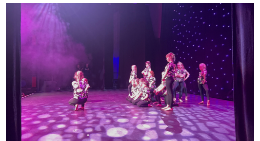
Our fabulous dancers on stage at the LBT