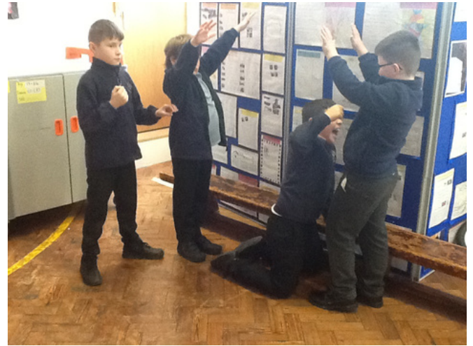
Year 4 Mayan workshop freeze frame.

Year 4 students have embarked on a fascinating journey into the mysteries of the Maya civilization. 'The Mysterious Maya' curriculum is captivating our young historians as they learn about the rich cultural heritage, advanced architecture, and mysterious disappearance of this ancient civilization. They thoroughly enjoyed their Mayan workshop that included role play, drama activities, freeze frames and quizzes.