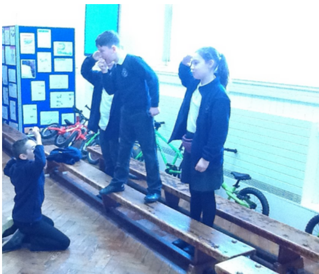
Year 6 WW2 role play.

In Year 6, our children are engaging with the poignant topic of 'Lest We Forget.' Through thoughtful discussions and historical exploration, they are gaining a deeper understanding of the impact of wars on individuals and societies. The curriculum aims to instil a sense of remembrance and appreciation for the sacrifices made by those who came before us. The children enjoyed engaging in the WW2 workshop that included role play, drama activities, freeze frames and quizzes.